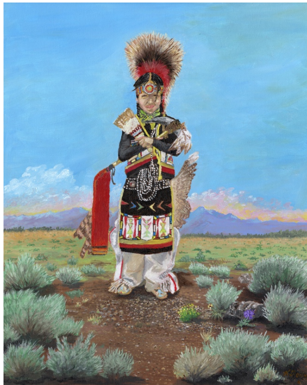
Youthful Traditions 16x20" Oil on Canvas 2023