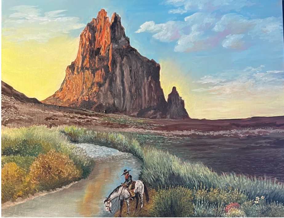
Taking a Break at Shiprock 16x20" Oil on Canvas 2023