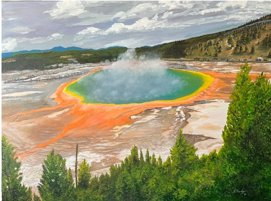
Rainbow Pool Yellowstone 30x40" Oil on Canvas 2026