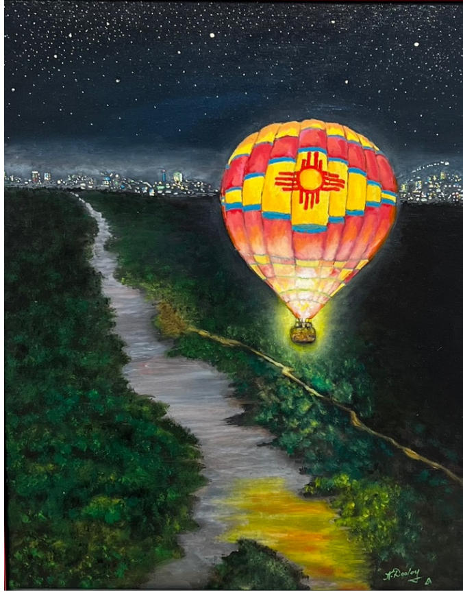
Night Flight over the Rio Grande 16x20" Oil on Canvas. 2025