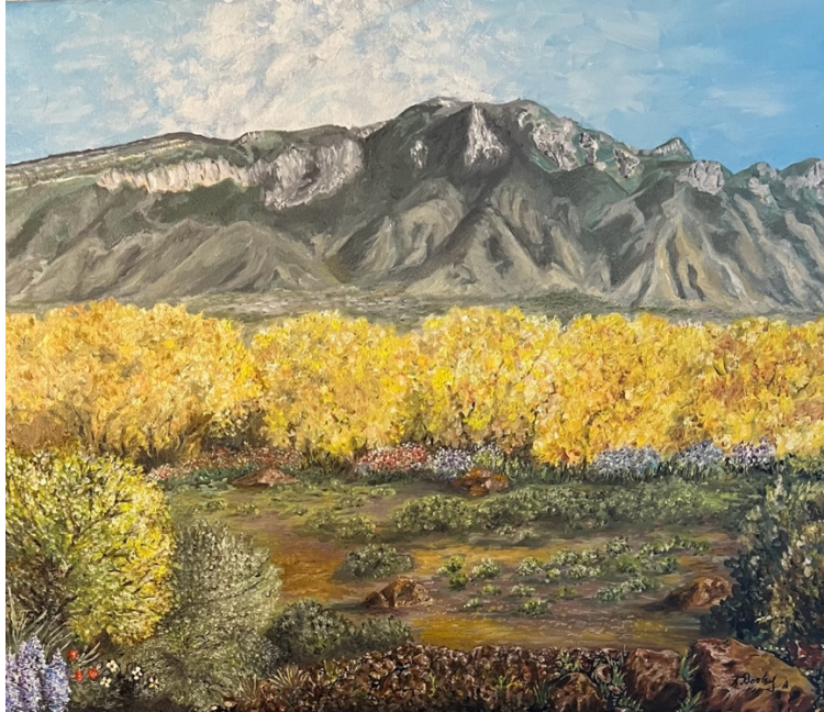
Watermelon Mountain in Albuquerque 16x20" Oil on Canvas 2023