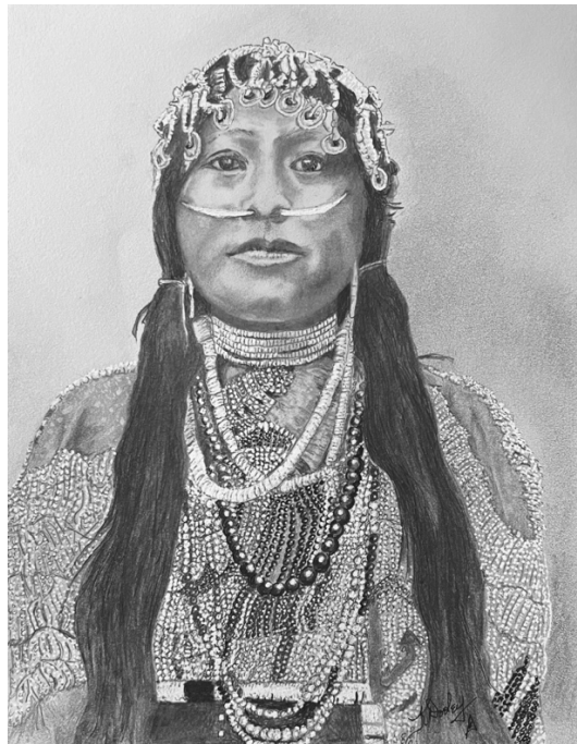
Wisham Woman 11x14" Mixed Media 2025