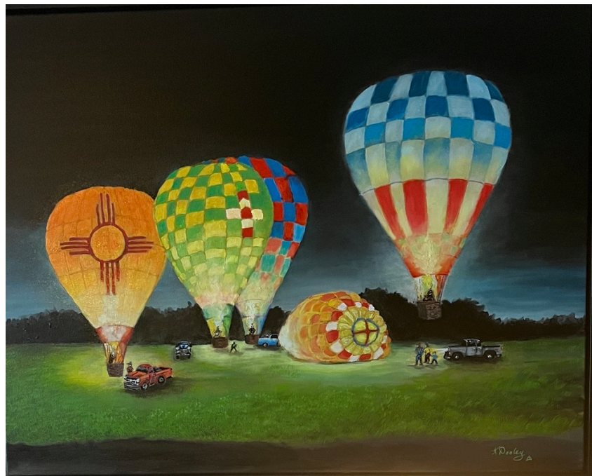
Go Glo New Mexico 16x20" Oil on Canvas 2023