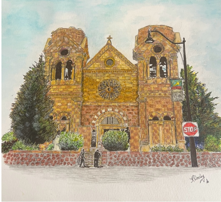
St. Francis Cathedral in Santa Fe, NM 11x14" Mixed Media 2025