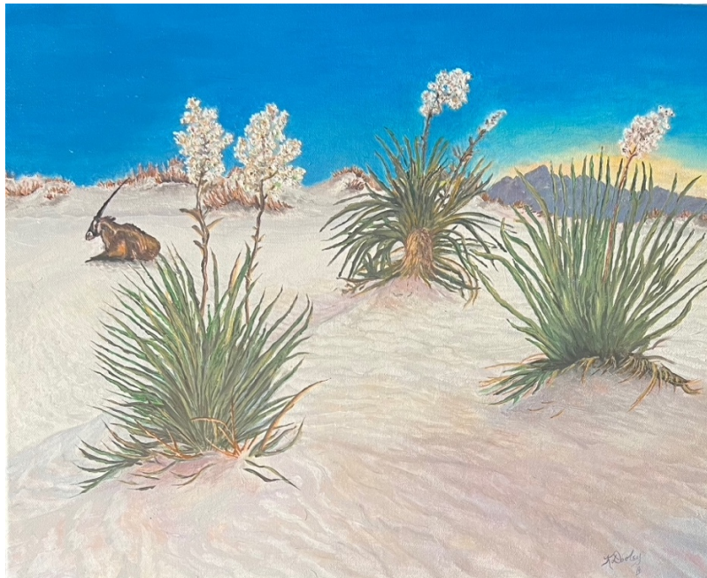
Taking a Break in White Sands NM 16x20" Oil on Canvas 2023