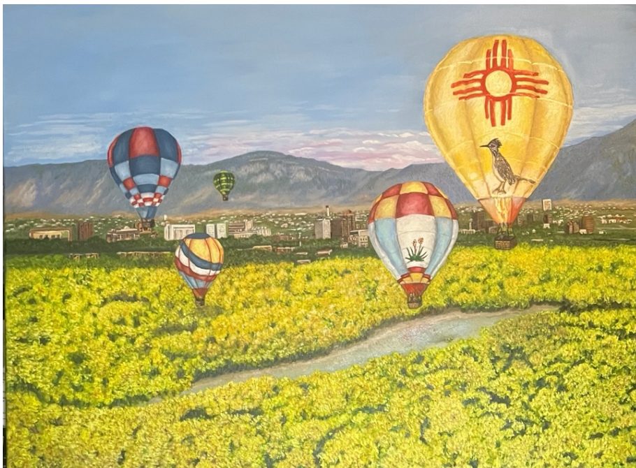
Balloons Over Albuquerque 30x40" Oil on Canvas 2026